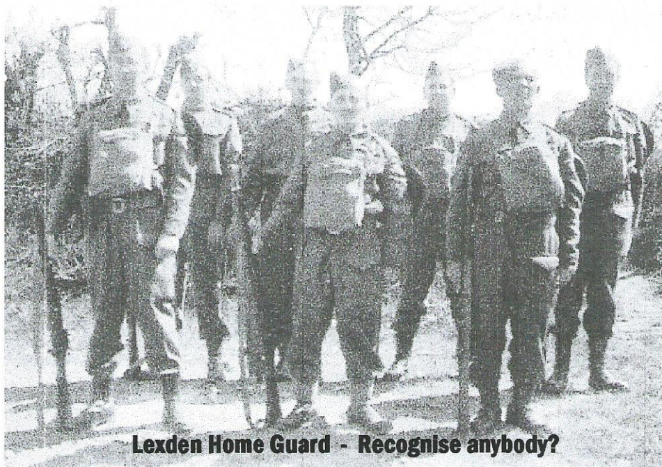
Lexden Home Guard - Recognise anybody?

There's no rush., we have all year to collate and write up the material and at the end of the year we can have something to be proud of that we can leave for others to study.