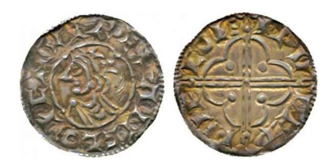
A penny (c1017-23) minted in Colchester during the reign of Canute (1016-35) by a wulfwine or moneyer (someone with authority to mint coins)

therefrom over the wall." Later the same year, after conquering other Viking armies, "before Martinmas, went King Edward with the West-Saxon army to Colchester; and repaired and renewed the town, where it was broken down before."