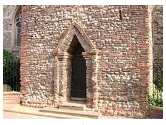
Saxon doorway of 11<sup>th</sup> century Holy Trinity Church in Trinity Street. Colchester, reusing Roman materials

In 917 the town appears to have been refurbished after it was recaptured by armies under Edward the Elder. The Anglo-Saxon Chronicle records that, after regaining Maldon, Edward's army "went to Colchester, and beset the town, and fought thereon till they took it, and slew all the people, and seized all that was therein; except those men who escaped