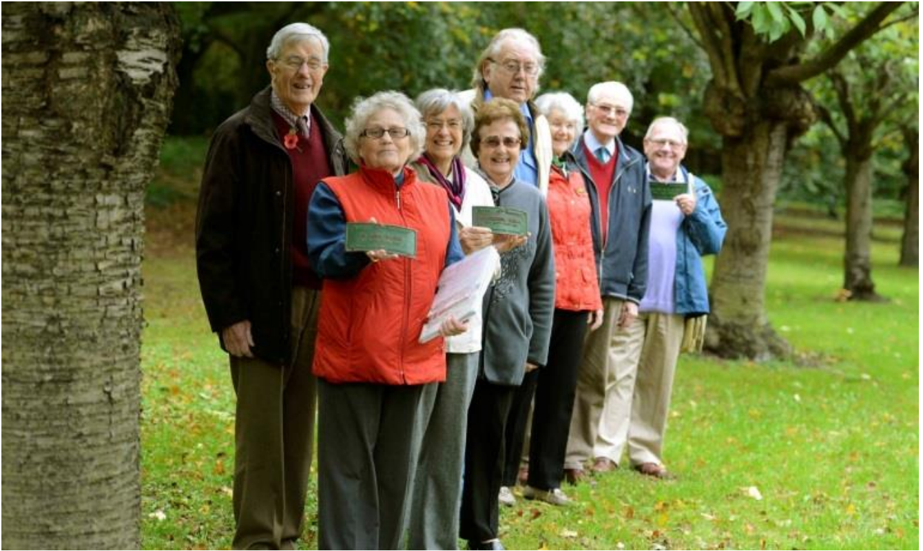
Members of the Lexden History Group at the Avenue of Remembrance Appeal Launch