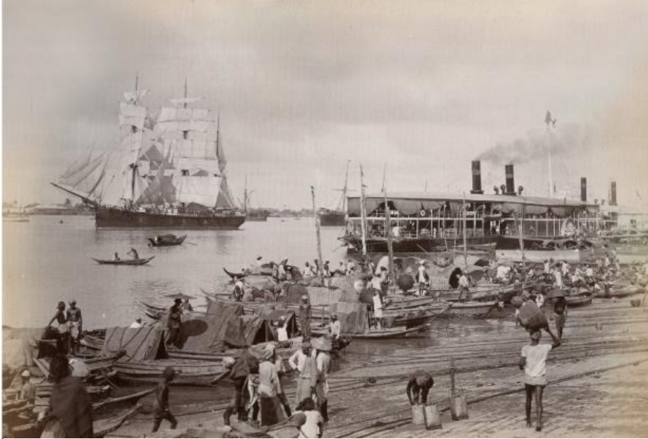
View over the Rangoon River late 19 th Century