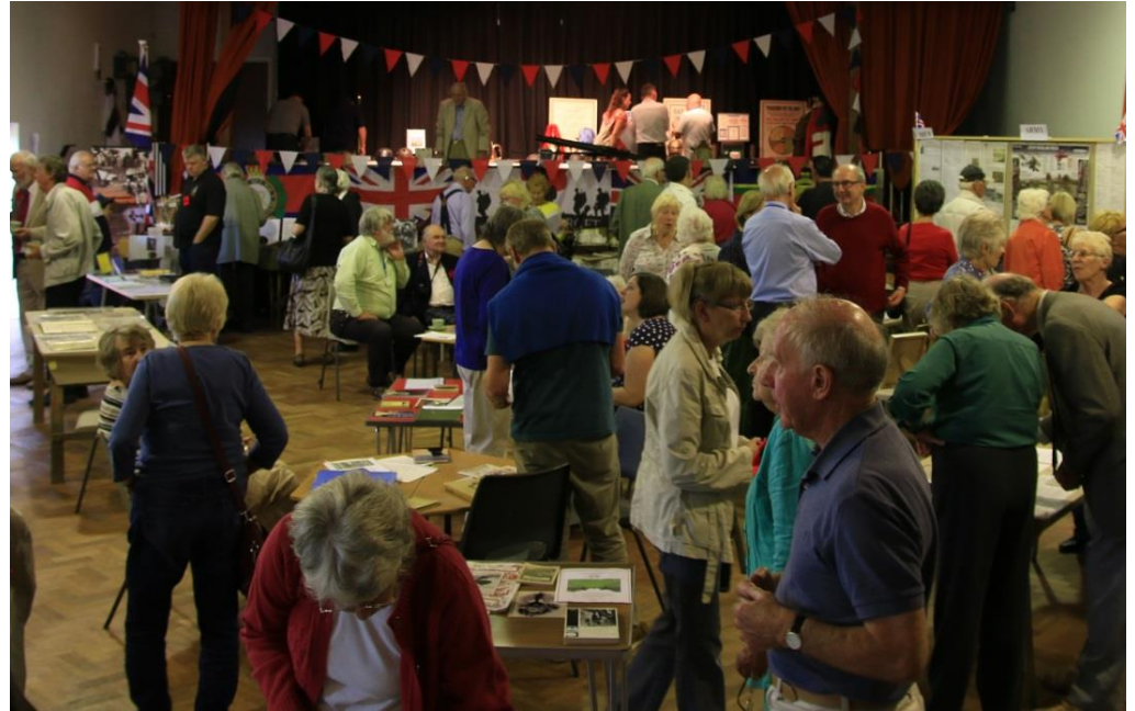
WW1 Exhibition 27 th /28 th September

Appeal to find long-lost pieces of Colchester's History